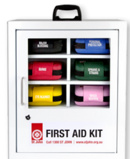
Complete modular kit