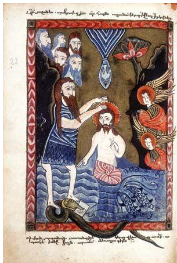
The Baptism of Jesus by St John The Baptist.

May the spirit of St John Ambulance reach out to them; and may the work of St John Ambulance – both in preventive medicine and in the promotion of safety, and in the treatment support of those who are sick and injured in the prehospital domain – continue to be a source of pride and fulfilment of all those who serve in the name of St John.